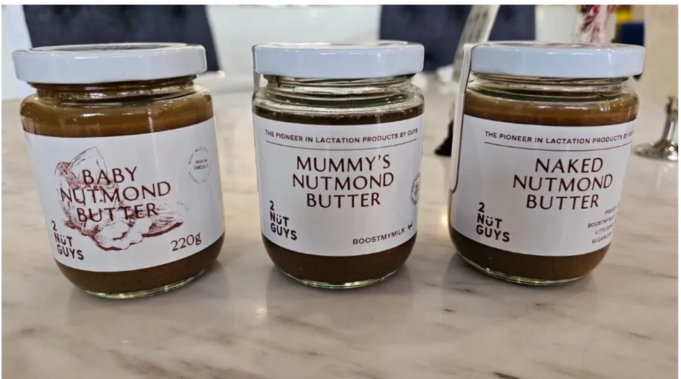
2NütGuys' Nutmond Butter

Their flagship product, Mummy's Nutmond Butter , is a blend of almonds, brewers' yeast, flax and chia seeds, and almond oil. Designed to support lactation, this nut butter uses Gula Melaka instead of white sugar, reflecting their Asian heritage and promoting healthier eating choices.