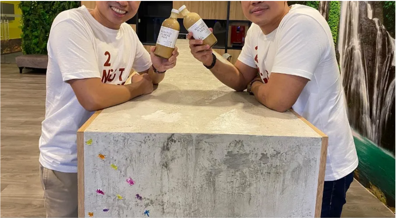
Founders of 2NütGuys

Acknowledging the vital contribution of mothers, 2NütGuys incorporates the word “Mummy” in most product names. Their logo, featuring a smiling face and two lactating breasts, symbolises the joy their products bring to breastfeeding mothers.